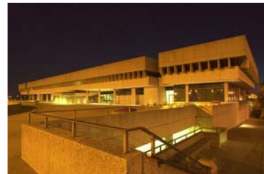
Avon Williams Campus

the 2007 Annual WHET Conference, please do not hesitate to contact me at (615) 963-7494 or via email at tcarter@tnstate.edu .